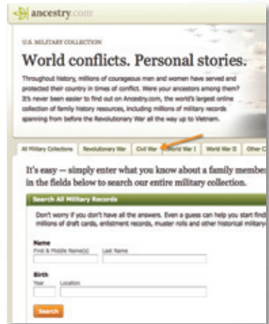
Military Search Page

Look for clues in nonmilitary records at Ancestry.com. Both the 1910 and the 1930 census indicate prior military service in major conflicts. (You'll find that info on the far right side of the page.) The 1840 census lists Revolutionary War pensioners. You may find similar information in state censuses, too. Apply these clues to a search of the specific conflict mentioned at www.ancestry.com/military .